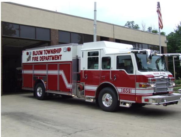
Engine Rescue 551

Bloom Township Fire Department adds new vehicles to the fleet. In 2009, we have added two new vehicles to the department. We purchased a new medic (ambulance) and a new fire engine. These additions will allow us to continue to provide the services you expect.